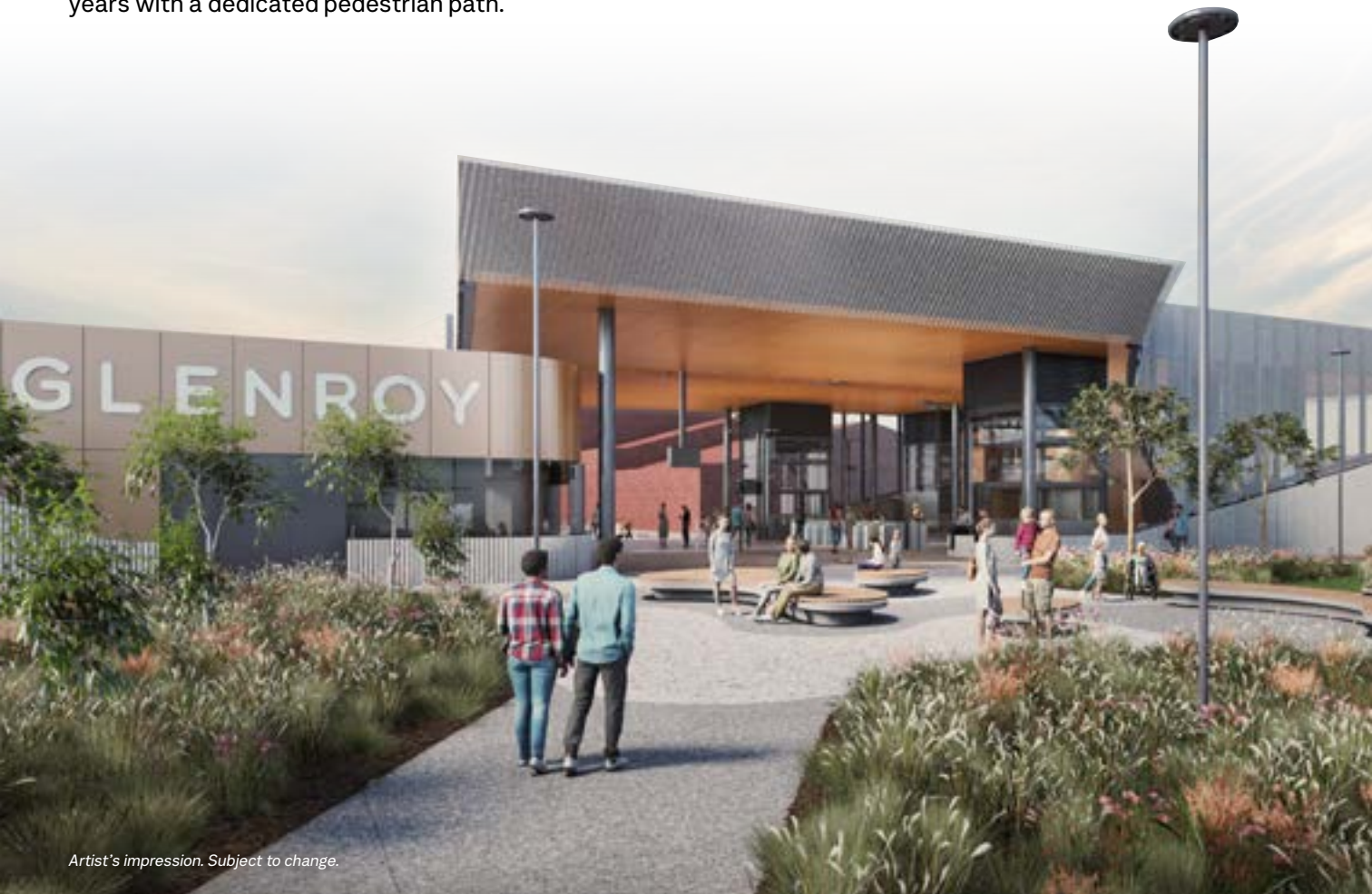
Artist's impression. Subject to change.